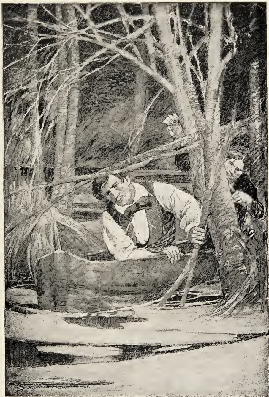
Neil forced the dugout through the water.— Page 142